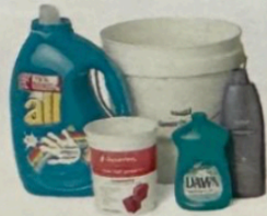
Plastic Containers #1-7