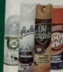
Household Hazardous Waste