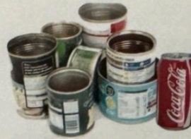
Metal Cans & Containers