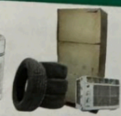
Tires CFC Appliances