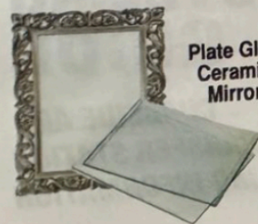
Plate Glass Ceramics Mirrors