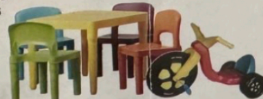
Large Plastic Items / Toys