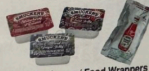
Condiment Packages / Food Wrappers