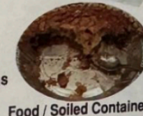
Food / Soiled Containers