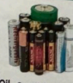
Small Consumer Batteries